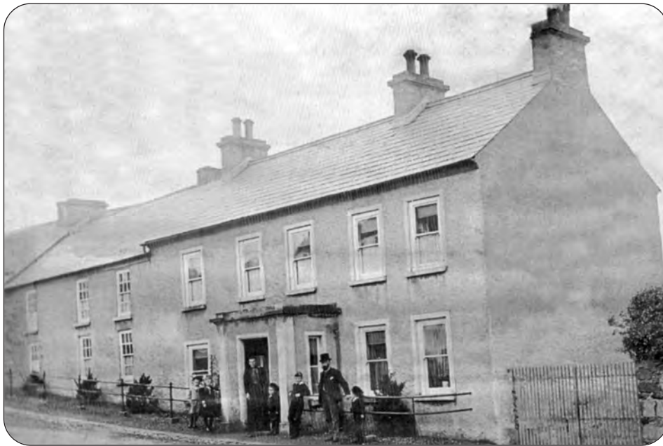
The Bennet house as it was. There were fields and a tennis court behind it.